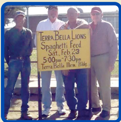
*Pictured above are few members from the original Terra Bella Lions Club from 2013.

WCICLC is one of a kind club, because it was revived after Terra Bella Lions Club closed down, and became a specialty cyber club, with members from Kings, Fresno, Tulare, and Madera Counties respectively. Furthermore, while the name suggests "Indian," our club welcomes and is open to all the demographics. Our members range from Leo-Lions, to individuals, family units, and couples in service, coming from various professional backgrounds as well. We have only operated under WCICLC since 2018 (originally chartered in 1964), but the club has been involved in different projects, either hosting health camps, food distributions, blood drives, backpack distributions, fundraising at the Blue Angels airshow, etc. We take great pride in our developing, yet mighty club, and hope to continue making impact in our communities in the coming years.