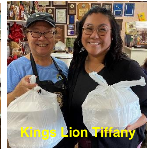
Kings Lion Tiffany