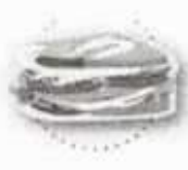
Ziploc & other reclosable food storage bags