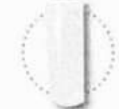
Pallet wrap & stretch film