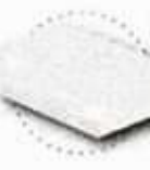
Wood pellet bags