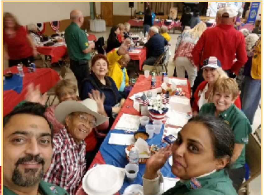
SECOND DISTRICT MEETING IN RICHGROVE SEEN ABOVE. REGISTRATION FOR THIRD DISTRICT MEETING IN FRESNO IS ON NEXT PAGE — > — >