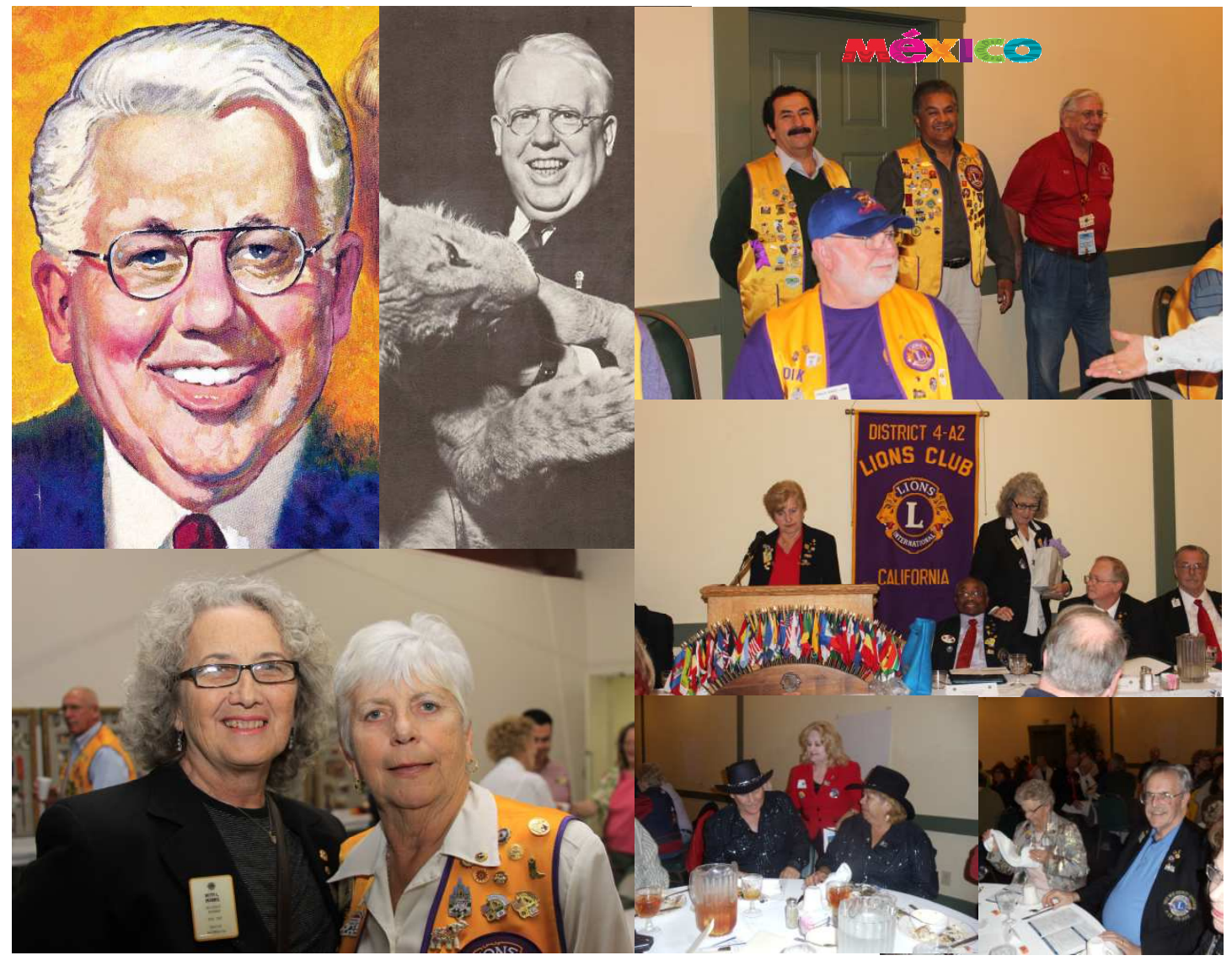
Visit Your Lions Website