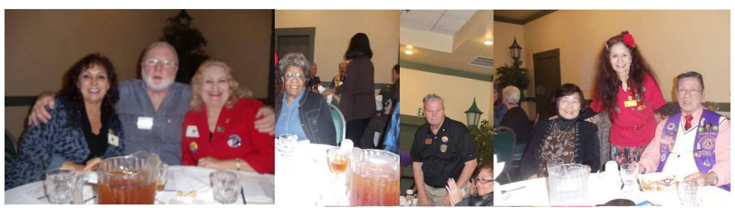
Visit Your Lions Website