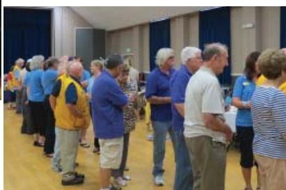
Lions Line up for Enchiladas