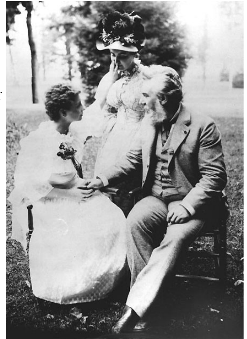
Helen Keller (Seated), Alexander Graham Bell & Annie Sullivan