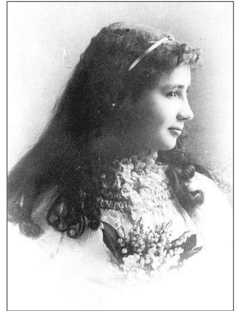
Helen Keller as a young woman with long hair

discover the cure for diabetes. Many times I have been told "I became a Lion because of what Lions did for me, now I want to give something back." Goodness, with a charitable spirit, a Lion Spirit, given in the form of service to others is a powerful thing. It has a way of manifesting itself in strange and wondrous ways. Our service to others is our legacy to ourselves, that our life had meaning in a profound way.