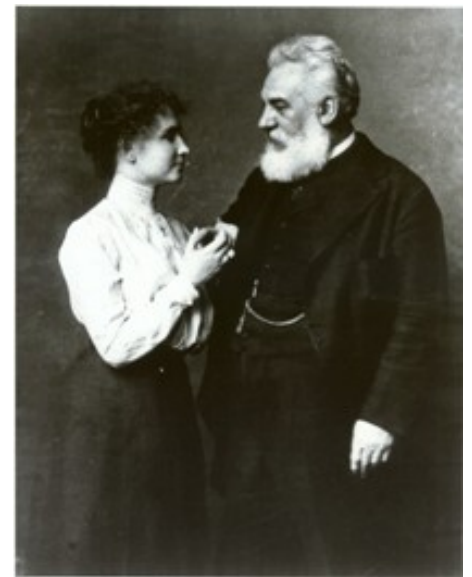
Helen Keller with Dr. Alexander Graham Bell

I am here to say that Lions, "You Are The Heroes"! You are the Annie Sullivan's of this World! Thank God for You!